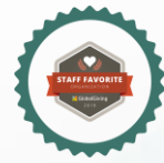
Staff Favorite Organization 2020, Global Giving