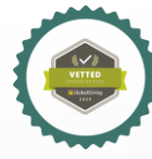
Vetted Organization 2020 Global Giving