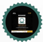
Winner, Hajiya Gambo Sawaba Community Impact Award